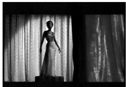
>If You Can Dream<, Meet Me in Las Vegas

Yet if she most often has literally little room for manoeuvre, this does not mean that the space does in fact utterly contain her. She has a small cabaret space for >Come Out of the Clouds< (THE DUCHESS OF IDAHO, USA 1950, Robert Z. Leonard), for instance, which she enters down a short and narrow flight of stairs. Yet as the number proceeds, the camera follows her movements to encompass an ever widening space, which even towards the end takes in some clients sitting at a table. At one point near the beginning of the number, while Horne is still at the end of the short run of steps, she puts her left foot up on a bench to the side of the stairwell, crooking her leg, and puts her hand on her hip, as the song admonishes <u>Baby</u>, come of the clouds<; it is a somewhat unusual pose for a woman and even more for Horne, suggesting a deliberate taking up of space and one that precedes her beginning to make fuller use of the small performance space available. It is a little defiance of confinement.