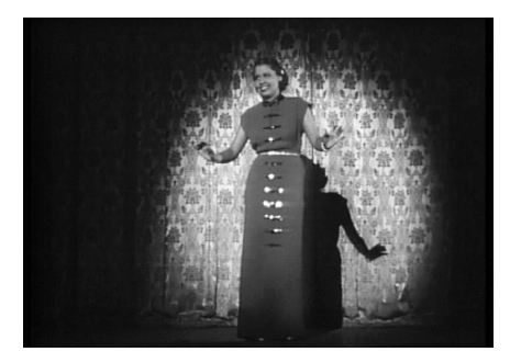
... turn into a blues.«